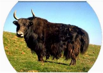
Yak ou Yack